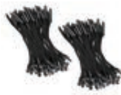
Bungee Cord #BC111 - 100 pcs/bag, 10 bags/ctn