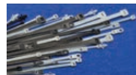
Cable/Zip Ties 50 & 120 Lbs - 100 pcs/bag