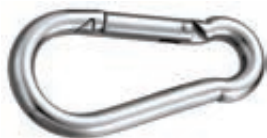
Zinc Plated Steel Snap Hooks #SH80ZP, #SH100ZP & #SH120ZP 100 pcs/ctn