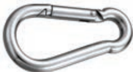
Zinc Plated Steel Snap Hooks #SH80ZP, #SH100ZP & #SH120ZP 100 pcs/ctn