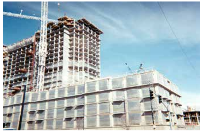
Building Abatement Enclosure